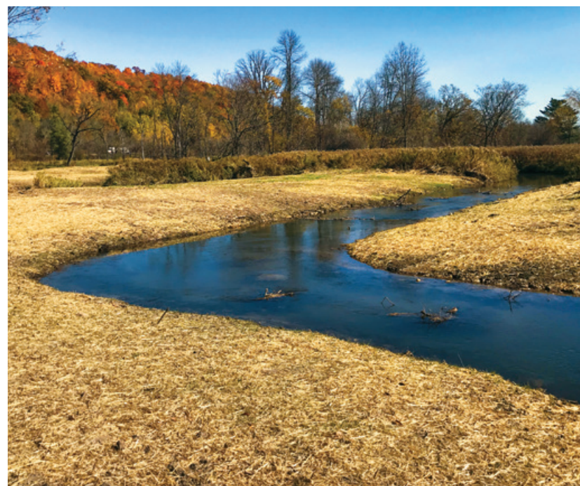
Gilbert Creek, Wisconsin

The Fish Habitat Writing Award is open to all contestants participating in the Fish Art Contest. In the writing portion of their entry, participants should highlight the unique habitat requirements of their fish species and the importance of quality habitat for all aquatic species. Winners will be selected in four grade categories; Kindergarten-3rd grade, 4th-6th grade, 7th-9th grade, and 10th-12th grade. Winners will be announced in May 2021.