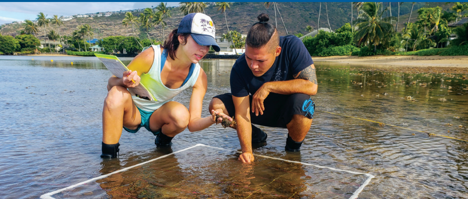
Maunulua Bay, Hawaii