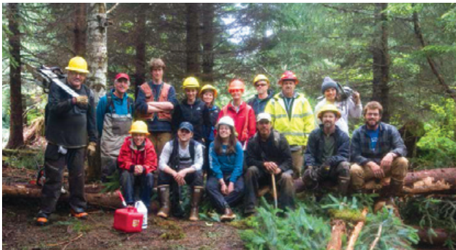
Hoonah Native Forest Partnership Work Crew & Partners