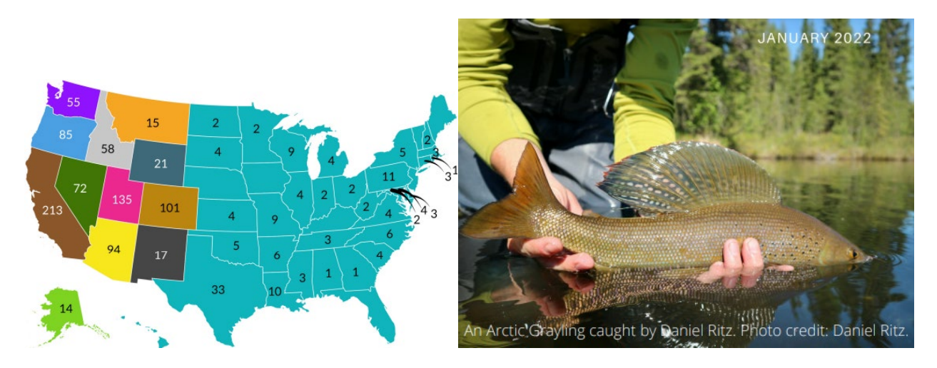
Figure 5 – Registrants as of December 2021 for the Western Native Trout Challenge by state (left). An Arctic Grayling caught by Daniel Ritz (right).

A central tenant of the program is to educate about these species, their history, management activities, and conservation status. Anglers must catch native trout in their historic range or watershed as that is part of learning about the fish. Over 1,200 people have registered for the Challenge to date. California leads the nation in registrants, followed by Utah, Colorado, and Arizona. A total of 85% of registrants are adults, and 14% are youth under the age of 18. Master Casters comprise almost 7% of Challenge completions, followed by Advanced Casters (16%) and Expert Casters (71%). A few people have completed the levels multiple times! The Western Native Trout Challenge takes participants to unique western landscapes – mountains to deserts, small towns and cities, state and federal lands, National Forests to coastal streams, and the waterways in between. The Western Native Trout Initiative puts 92% of the registration fees back on the ground to support western native trout restoration projects, educational programming and volunteer events.