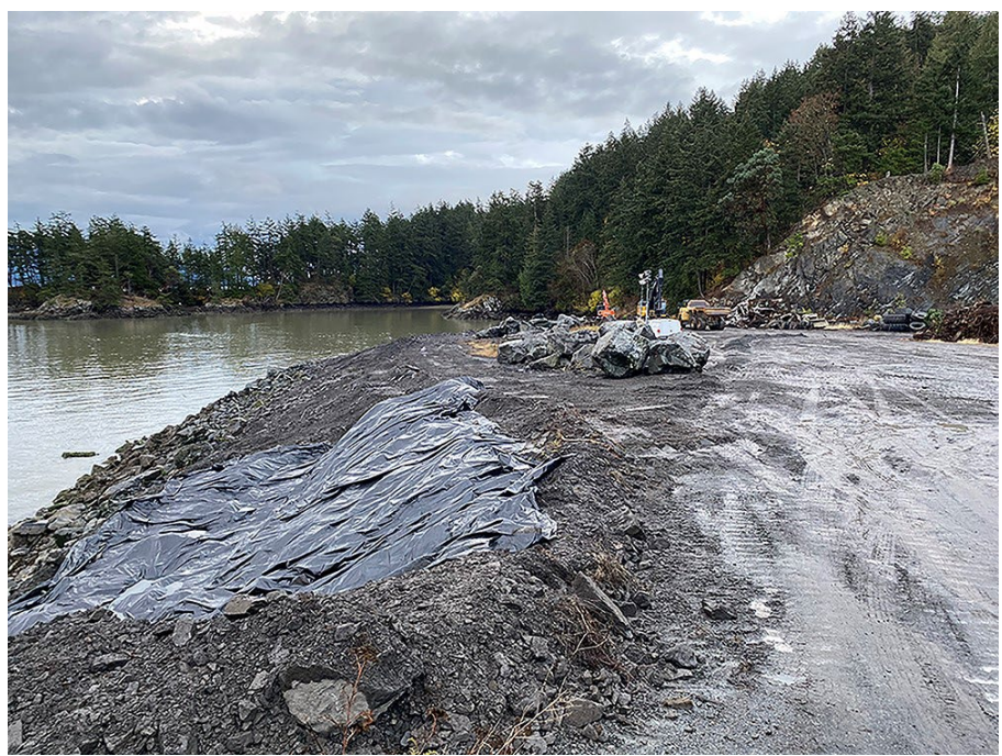
Figure 6 - By removing the armor rock and re-grading the shoreline during its mine reclamation project, the Lummi Island Heritage Trust was able to connect the upland corridor to nearshore habitat and help the shallow water habitat recover its natural processes.

In early 2023, the Aiston Reserve Nearshore Restoration Project was completed in Puget Sound, Washington with funding from Pacific Marine and Estuarine Partnership. This project, conducted by the Lummi Island Heritage Trust, improves habitats for forage fish spawning and migrating juvenile salmonids by restoring nearshore sediment processes and habitat connectivity and creating a pocket beach along 500 linear feet of shoreline. The project removed fill and shoreline armor and nourished the beach with sediment sized appropriately for forage fish spawning. The project enhanced a fully connected watershed from forested uplands to the nearshore and expanded eelgrass and kelp beds. The project was funded in part by the Pacific Marine and Estuarine Fish Habitat Partnership.